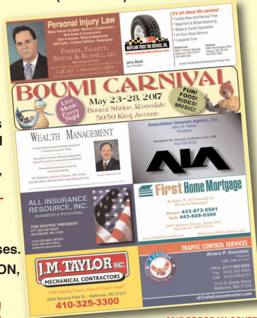
2017 PROGRAM COVER FOR ILLUSTRATIVE PURPOSES ONLY